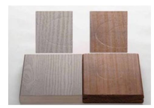
Clubhouse Brazilian Hardwood